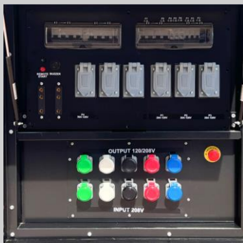
For example purposes only