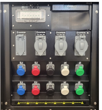
True 120V 20A outlet available in all phases.