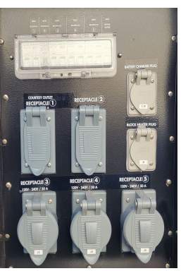
True 120V 20A outlet available in all phases.