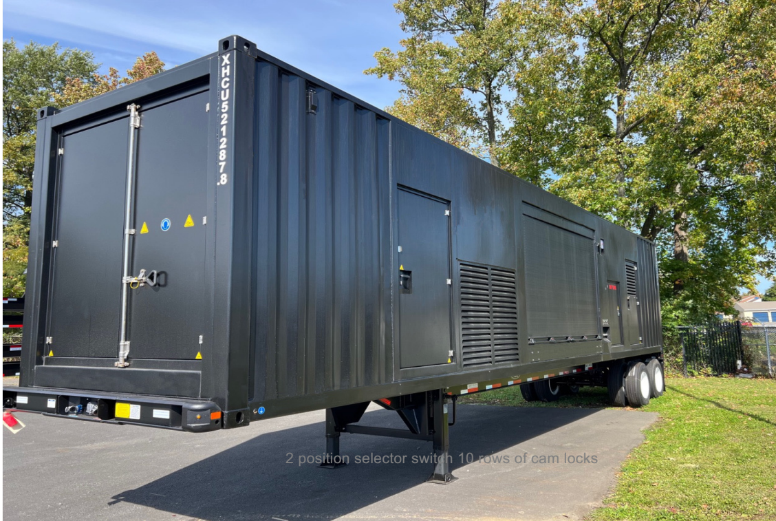
2 position selector switch 10 rows of cam locks